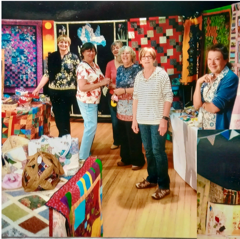
From Marie-Louise - the MVQ stall at Village Bookham Day in earlier years.