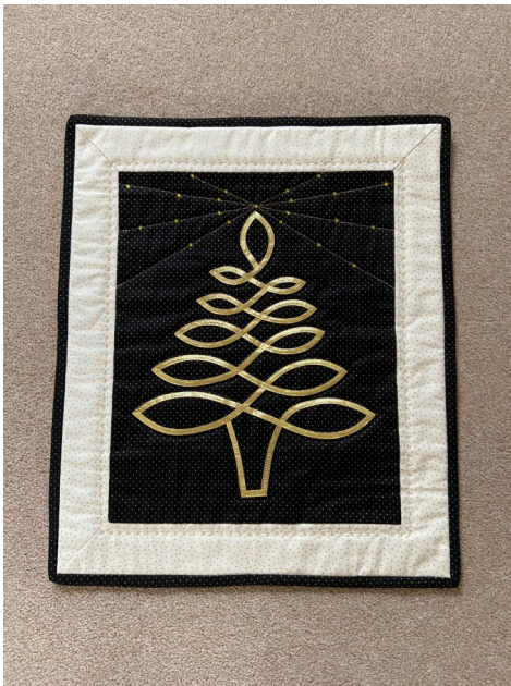
Members' Work—well done