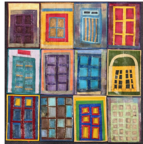
Gillian Travis examples of Windows and Orange Peel quilts