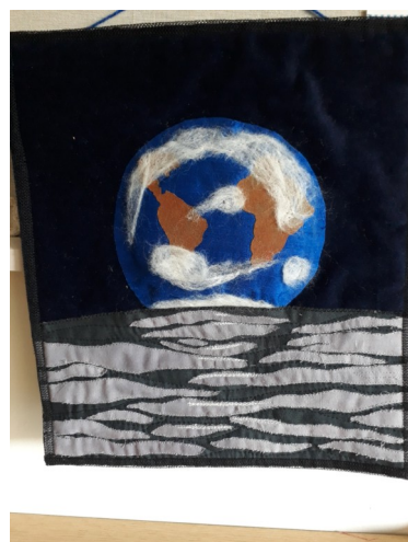
Earth Challenge 2020