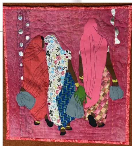
Indian Ladies—Sue Waters Workshop with Gillian Travis