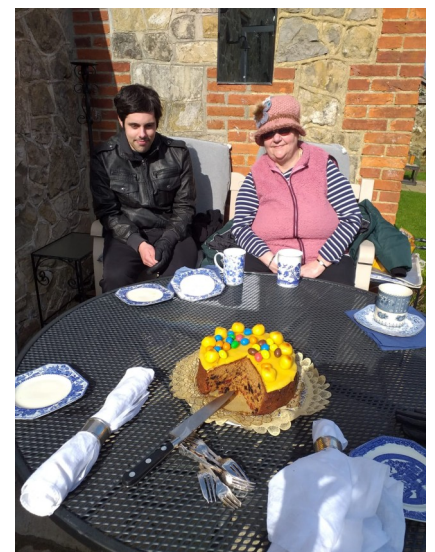
Delicious Easter Cakes