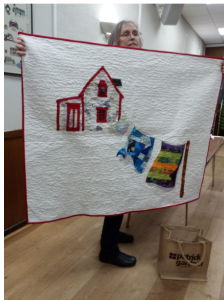
Show and Tell—January Meeting