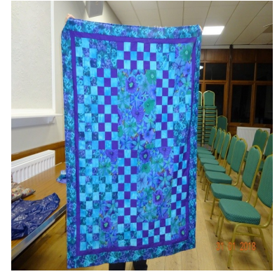
Some quilts from our Show and Tell